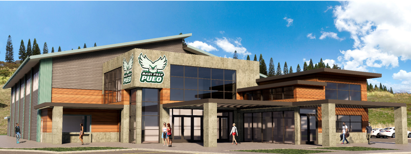
The Bozich Center for Athletics and Performing Arts